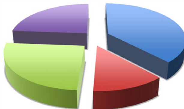
FIGURE 1. Non-alcoholic fatty liver disease prevalence in the groups of type 1 diabetes mellitus and obesity Notes: Diabetic group with (red) and without (blue) non-alcoholic fatty liver disease. Obesity group with (purple) and without (green) non-alcoholic fatty liver disease

While comparing two groups by this parameter we found significant differences between them concerning non-alcoholic fatty liver disease and dyslipidemia ( p < 0.05 ). Interestingly, dyslipidemia in the diabetic group showed no association with non-alcoholic fatty liver disease – 6.7% ( n=4 ), unlike the obesity group, where 29.3% ( n=17 ) of patients had dyslipidemia associated with non-alcoholic fatty liver disease ( p < 0.05 ) (Fig. 2).