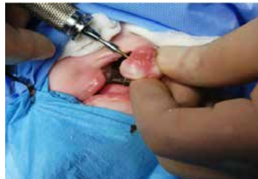
FIGURE 2. Placement of miniimplants in the intermaxillary bone.

were used as rods between the device and microscrews fixed on the maxillary bone.