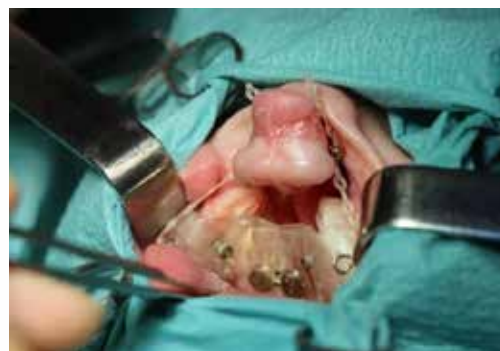
FIGURE 3. Fixation of the maxillary expanding apparatus, microimplants, rubber rods on the fragments of the upper jaw.

The fixed apparatus was fixed using microimplants used in orthodontics under general anesthesia. After adapting to the apparatus, the screw was activated by 0.5 mm once every two days with simultaneous activation of elastic traction for one link in three days. Given the further growth of the intermaxillary alveolar process of the upper jaw in length after cheiloplasty, it is necessary not to completely close the fragments of the cleft of the upper jaw, but also to leave diastasis between them to the width of the temporary tooth. The duration of the active period ranged from 20 to 25 days.